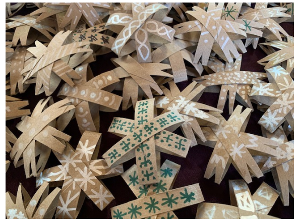
Our 2024 Christmas Ornaments

On Sunday, December 1, our projector bulb died just before the service so we also had the excitement of doing "old church" - prayer books and hymnals! Everyone was flexible and we did quite well.