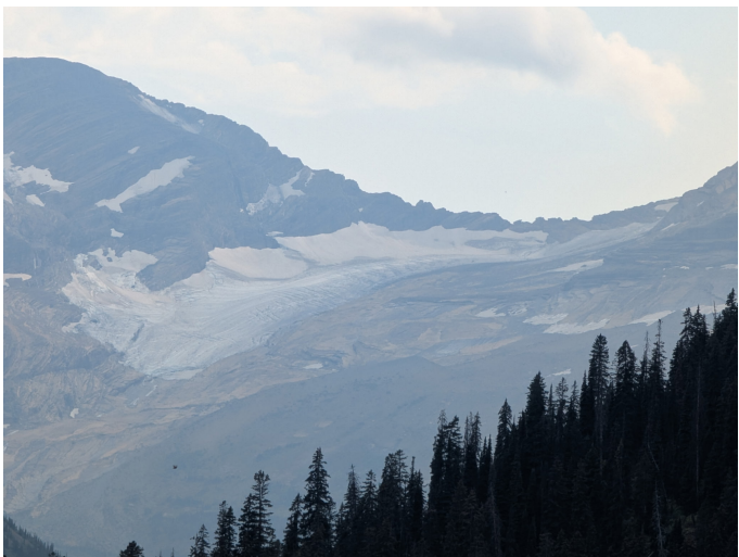
From the Mountain Top