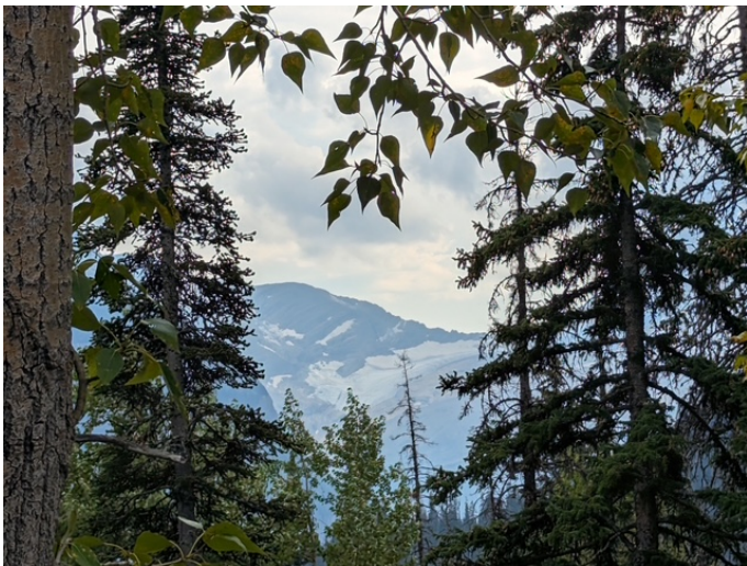
Darcy found the "glacier"!!!!