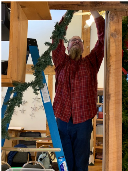
Decorating for Christmas