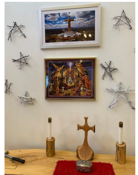
New nativity mosaic Fabricated by Karli Sorensen