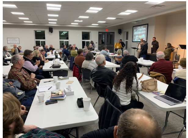
Above: 2026 Synod meeting at Sacramento

On January 4th we celebrated our name day - Epiphany - with a wonderful service and meal and many remembrances of the beginning of this parish 18 years ago. We look forward to 2026 and praise God for His leading and provision.