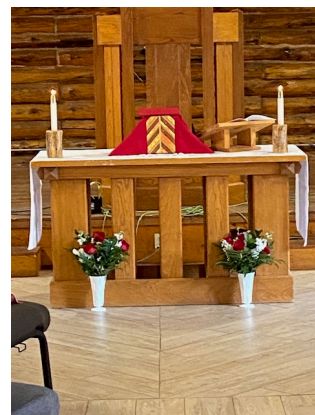
Below: Altar at Sacramento Chapel